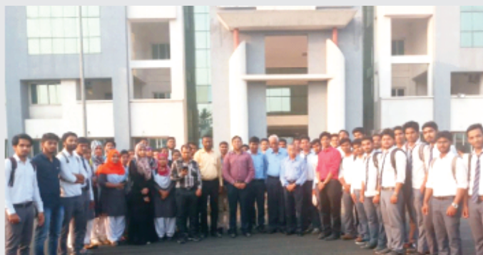
Site visit at Fire Engineering College, Nagpur