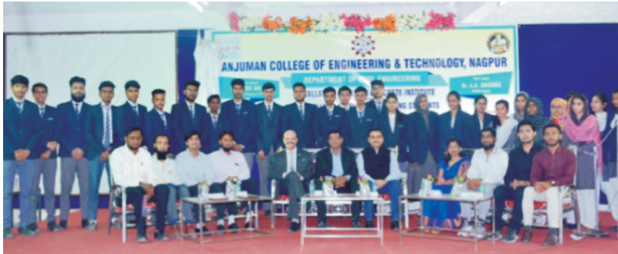
Installation of Student Forum 'ACES 2017-18' & Student Chapter 'ICI'