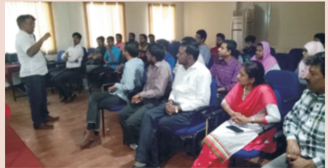
TITLE: - Software Application in Civil Engg. For Quantity Survey of Roads (15-16th Feb 2018)