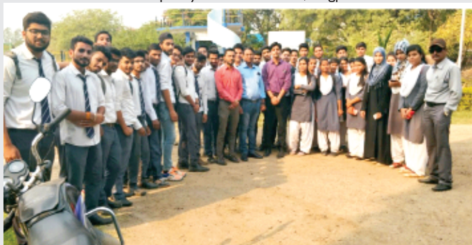
Site visit at Bhandewadi Sewage Treatment Plant, Nagpur