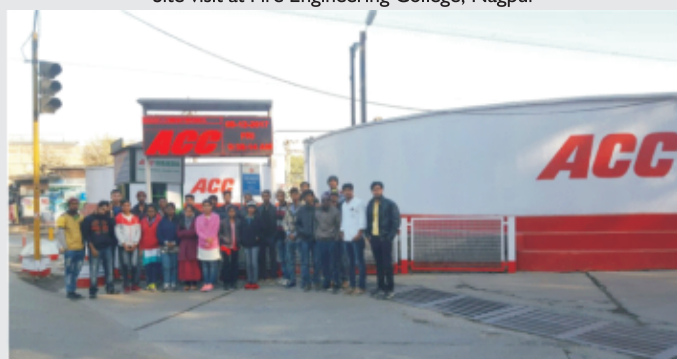
Industrial tour at ACC Cement Plant in Bilaspur, Himachal Pradesh