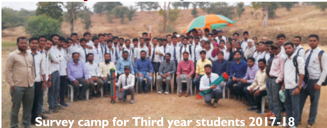
Survey camp for Third year students 2017-18