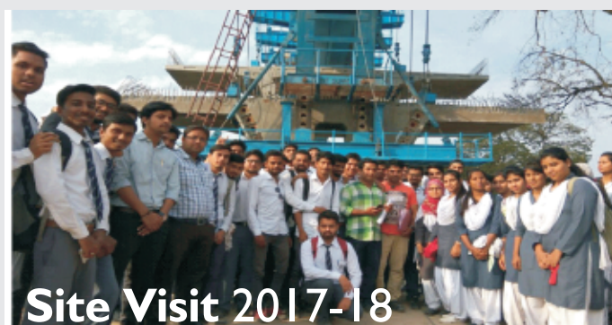
Site Visit 2017-18